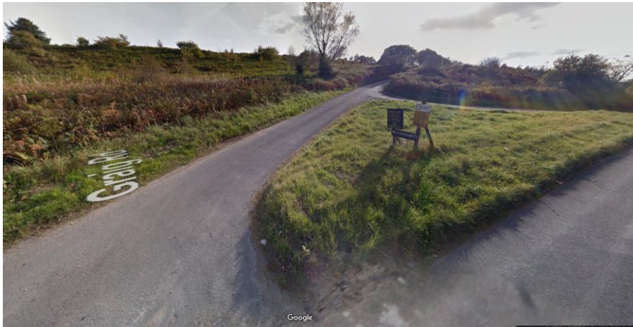
Figure 4 Graig Road – from the Ty Mawr Pub, head towards Caerphilly (Cefn Onn Farm), approx. 1 mile on the right)