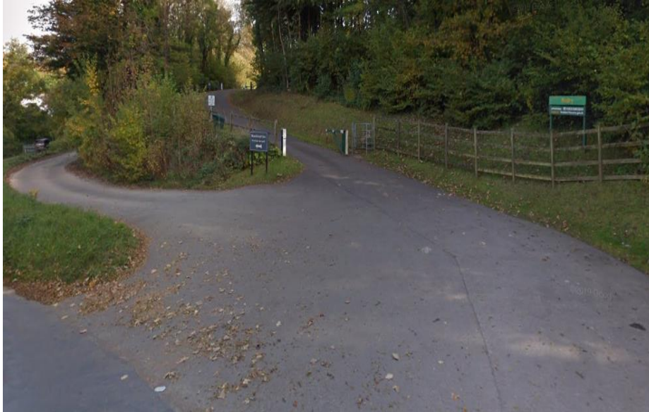
Fig 2 – From the Maenllwyd Junction, head towards Caerphilly on the main road, approx. 500yards, there is a step-over on the left.